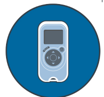
Remote Control Unit