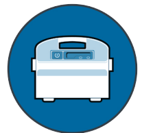
Full Filter Bag Indicator on Power Supply